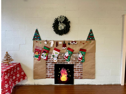
St. Mary's provided Christmas decorations and a party for the Grace kids!