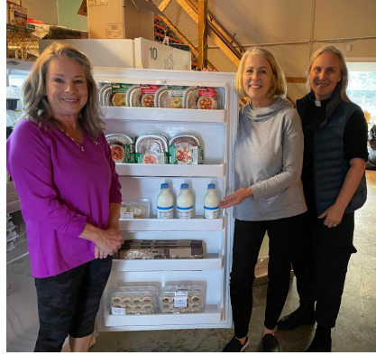
Holy Comforter gave us a new freezer!