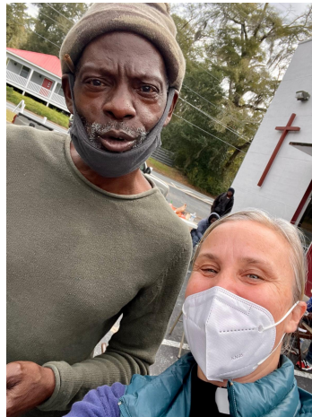
A big thank you!