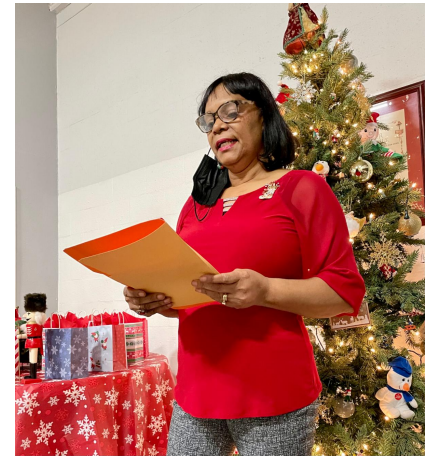
Brenda appreciates you!