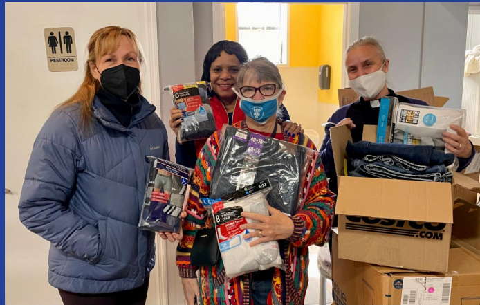
Thankful for First Presbyterian Church's underwear drive!