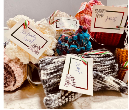
Warm and cozy items made with love!